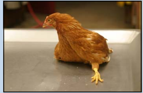
Leg paralysis in a chicken with Marek's

Marek's Disease (MD) is a common, acute or chronic, very contagious, and economically important disease of poultry, caused by an alpha herpes virus, named Marek's disease virus (MDV). There is wide variation in pathogenicity among the strains of MDV, which range from non-pathogenic to very virulent. MD has been reported in turkeys, quail and pheasants; however, chickens of any age are by far the most susceptible species. MD is the most common disease diagnosed in California backyard chicken flocks. MD infection occurs by inhalation of feather and dander epithelial cells containing infectious virus. Common clinical conditions include lymphomas (lymphoid tumors) in multiple internal organs, peripheral nerves, feather follicles, and eyes; immunosuppression ; transient paralysis; lymphoid