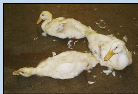
Ducks infected with R. anatipestifer exhibiting neurological signs

One of the most common diseases of young commercial ducks is septicemia associated with RA. Other species of birds such as geese and turkeys are also susceptible. The disease is characterized by listlessness, coughing, ocular and nasal discharge and ataxia. Polyserositis, including pericarditis, perihepatitis, airsacculitis, pleuritis and meningitis, is common in RA infections. There are numerous serotypes of RA making it difficult to control the disease by vaccination. Antibiotics are effective in treating RA infections.