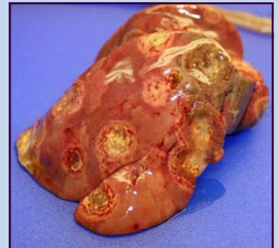
Turkey liver with multifocal lesions

Histomoniasis, commonly known as "blackhead", is a very important parasitic disease involving many species of gallinaceous birds particularly turkeys. Histomonas meleagridis , the causative agent of Histomoniasis, is a protozoan that can be closely associated with the cecal worm Heterakis gallinarum , which harbors H. meleagridis . H. meleagridis can be transmitted indirectly via ingestion of H. gallinarum embryonated eggs, which can contaminate the environment including feed and water. Earthworms can concentrate H. gallinarum larvae and histomonads and ingestion of these nematodes can also lead to disease. H. meleagridis can be transmitted directly through contact with fresh feces from sick birds. Clinical signs of histomoniasis in turkeys include sulfur yellow feces, depression, drooping wings, tucked heads, anorexia and loose feces; mortality can reach 70%. Necropsy lesions are most striking in the ceca and liver, demonstrating cores of caseous exudate and necrotic nodules (see picture). In chickens, the disease may vary from subclinical infection to severe illness with high mortality. Histomoniasis can be diagnosed histologically by demonstrating the presence of protozoal organisms associated with compatible lesions in the liver and ceca. Currently there are no effective drugs labeled to treat for this disease.