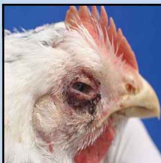
Conjunctivitis in a chicken with ILT

ILT, caused by Gallid Herpesvirus 1, is a respiratory disease primarily affecting chickens of all ages. The disease is characterized by ocular and nasal discharge, gasping, and death, with lesions most commonly seen in the conjunctiva and upper respiratory tract (see picture). Presumptive diagnosis of ILT can be obtained using histopathology and fluorescent antibody (FA) testing. ILT infections can be controlled with proper vaccination by the eye-drop method; however use of live vaccines for ILT is not advised as the vaccine virus can revert to virulence resulting in disease in susceptible birds. Strict biosecurity, cleaning and disinfection of premises, and increased down time between placement of each flock will help prevent ILT infections.