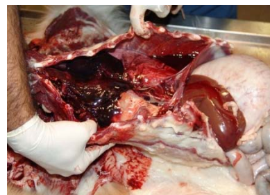
Intrathoracic hemorrhage seen in a dog.

Exposure in dogs is most likely from direct ingestion of AR-containing baits. CAHFS has also documented the occurrence of one or more AR in wildlife including mountain lions, bobcats, coyotes, foxes, Pacific fishers, badgers, raccoons, feral pigs, turkey vultures and golden eagles. In contrast to pet dogs, the most likely source of exposure for wildlife predators and scavengers is via ingestion of exposed prey species such as mice, rats and squirrels. Although uncommon, some AR baits contain a dye that causes a marked color change of fat and tissues in animals after ingestion (see photo of feral pig). Second generation AR are particularly hazardous due to their prolonged residence time in tissues such as liver. The long tissue half-lives result in the need for prolonged vitamin K treatment, which is antidotal. The toxicity of AR is species dependent. For example, cats (either domestic or wild) appear to be relatively resistant to AR intoxication compared to canine species. Unfortunately, the toxicity of AR in many wildlife species is largely unknown. Concern about exposure of non-target species, including children, domestic pets and various wildlife species, to AR has led the US EPA to recently place new restrictions on the use of AR. A summary of US EPA actions can be found at http://www.epa.gov/oppsrrd1/reregistration/rodenticides/finalriskdecision.htm .