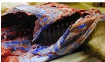
Diphacinone and blue dye from baited grain in feral pig.

These restrictions will likely decrease the exposure of household dogs to AR and hopefully decrease the number of dogs presented for treatment. The impact that the restrictions will have on wildlife exposure remains to be seen.